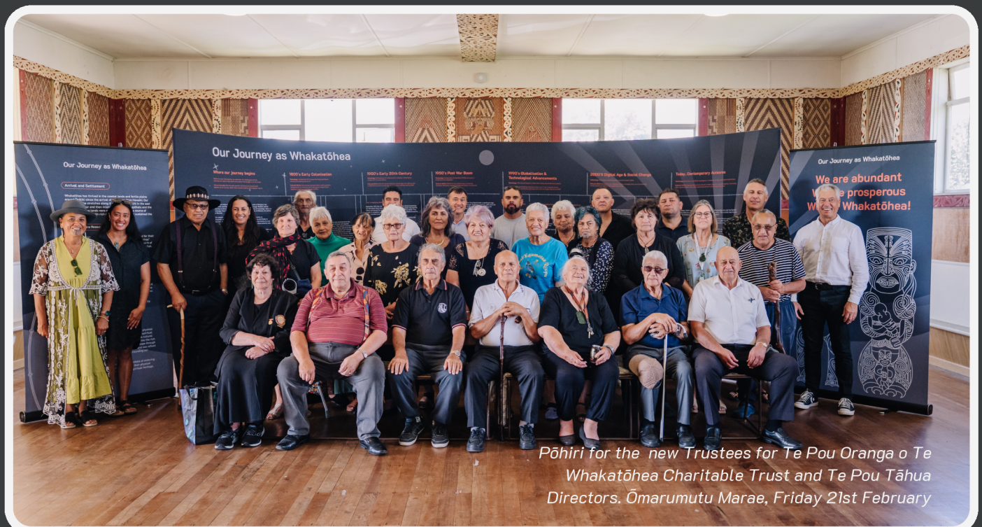
Pōhiri for the new Trustees for Te Pou Oranga o Te Whakatōhea Charitable Trust and Te Pou Tāhūa Directors. Ōmarumutu Marae, Friday 21st February