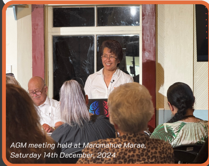
AGM meeting held at Maromahue Marae, Saturday 14th December, 2024

The AGM was live-streamed and can be viewed on the Whakatōhea website. All reports presented at the hui are available online.